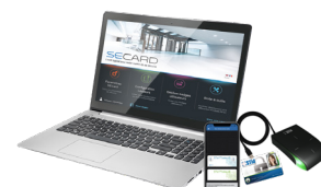
SECARD SECARD configuration kit and SSCP® v1 & v2 and OSDP™ protocols