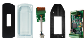
Decorative plate / Shield / TBLOCK / Spacers / Decoders...